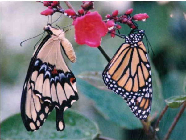
Giant Swallowtail ( citrus trees, rue), Monarch (milkweed) and the Blue Eastern Swallowtail (dill, parsley, fennel, rue, herbs )